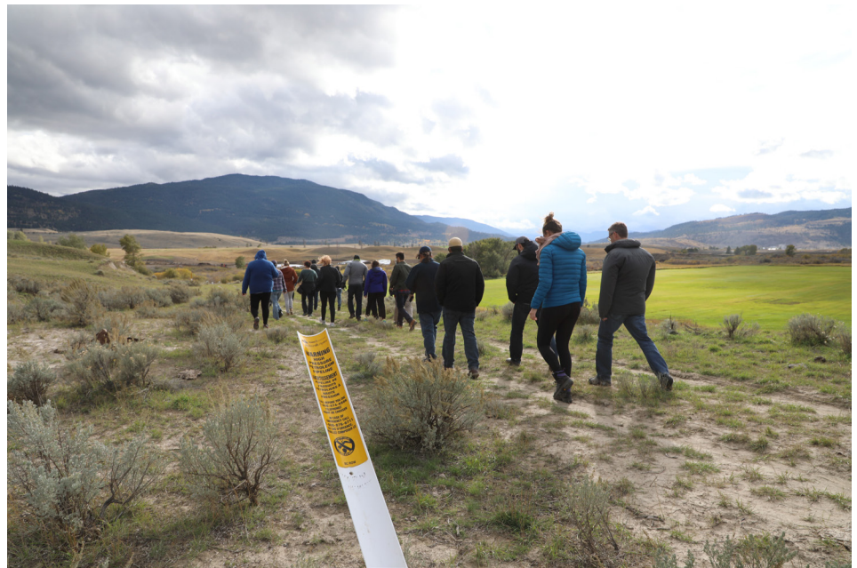
IAMC-TMX and CER Indigenous Monitor Training, Merritt, BC, October 2019

Indigenous communities may have different perspectives on what construction activities are important to monitor. This is why the IAMC-TMX is also working closely with federal regulators and Indigenous communities to make sure that Indigenous values guide when, where, what, and how regulators and Indigenous Monitors conduct inspections. The IAMC-TMX has begun to meet regularly with federal regulators to jointly plan the timing, scope, and locations of compliance verification activities to ensure Indigenous concerns and interests are