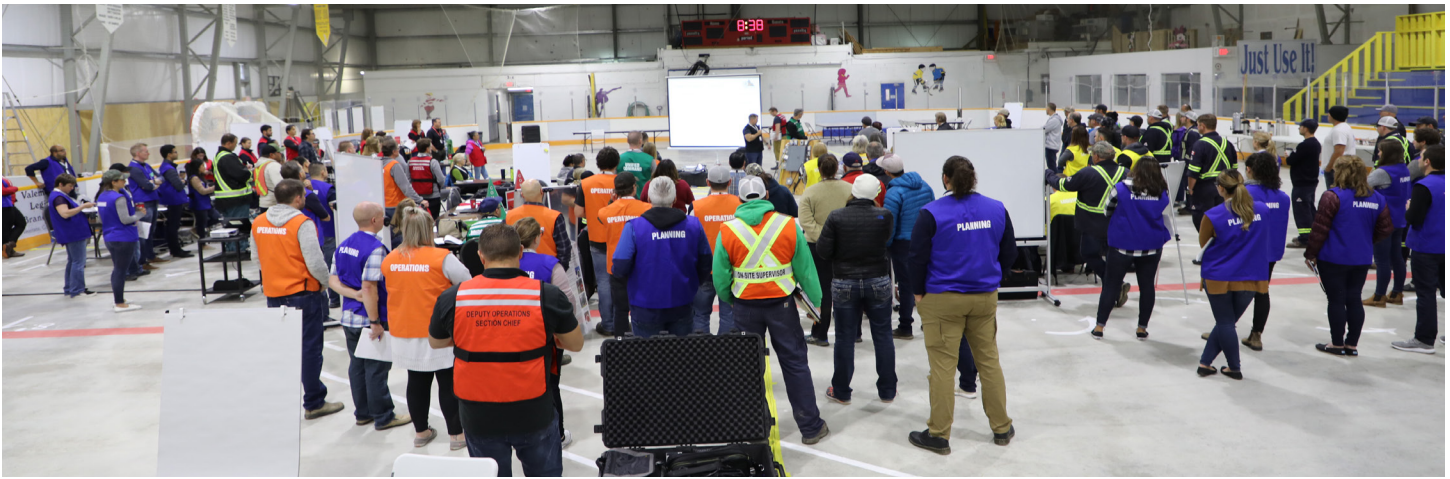
Trans Mountain's Incident Command Post, Valemount Full-Scale Exercise, September 2019