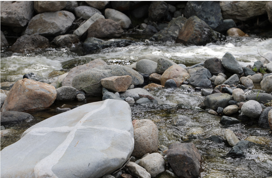
Trans Mountain Pipeline water crossing location near Merritt, BC.